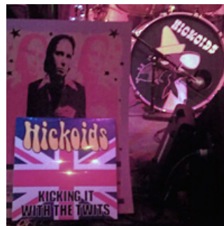
Hickoids Artist Page